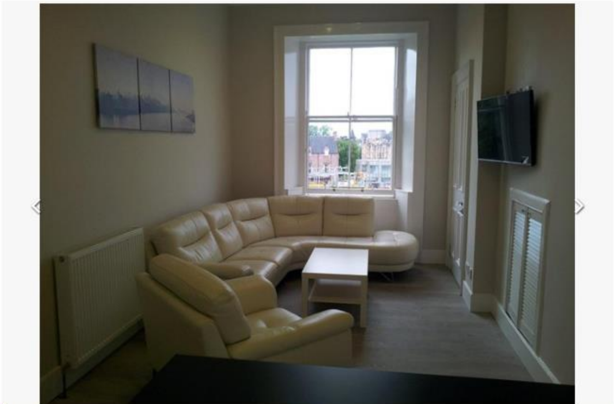
8 of 16