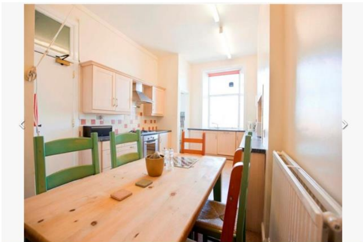
5 of 6