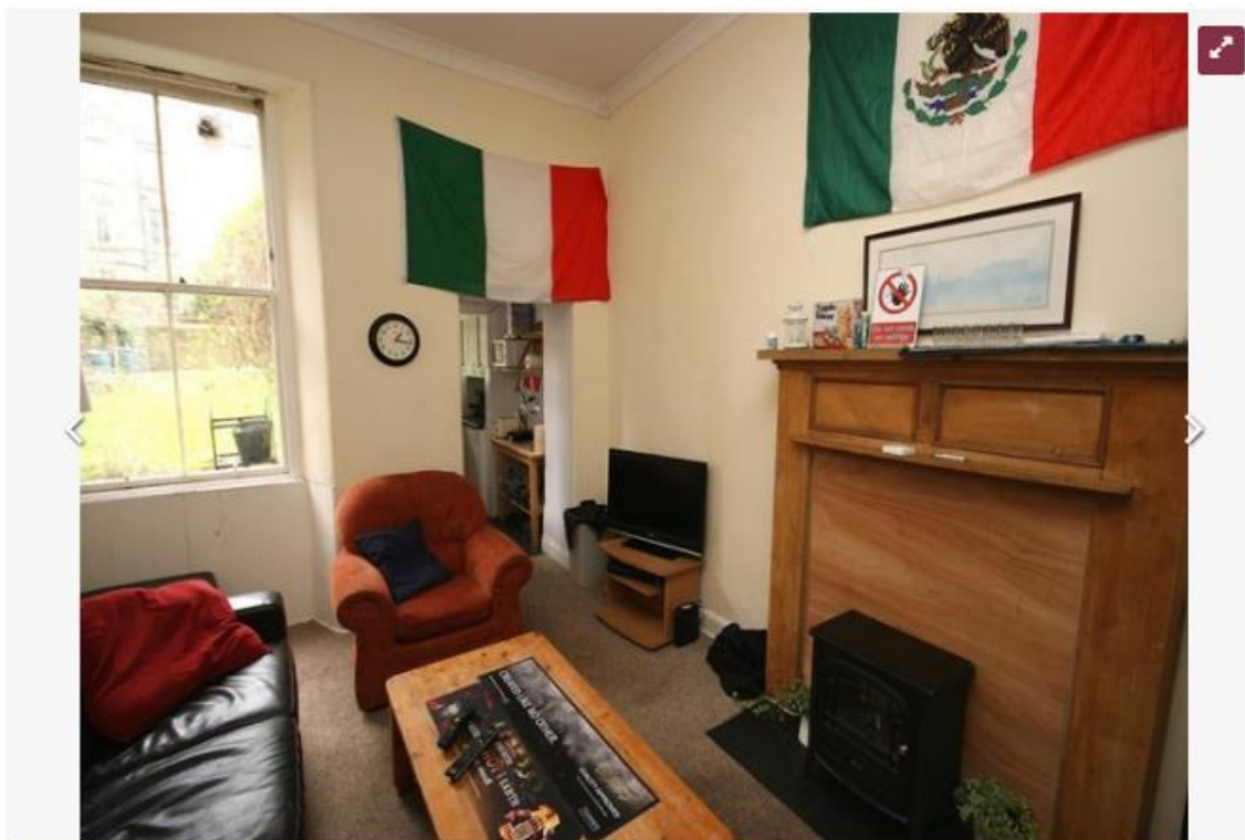
2 of 10