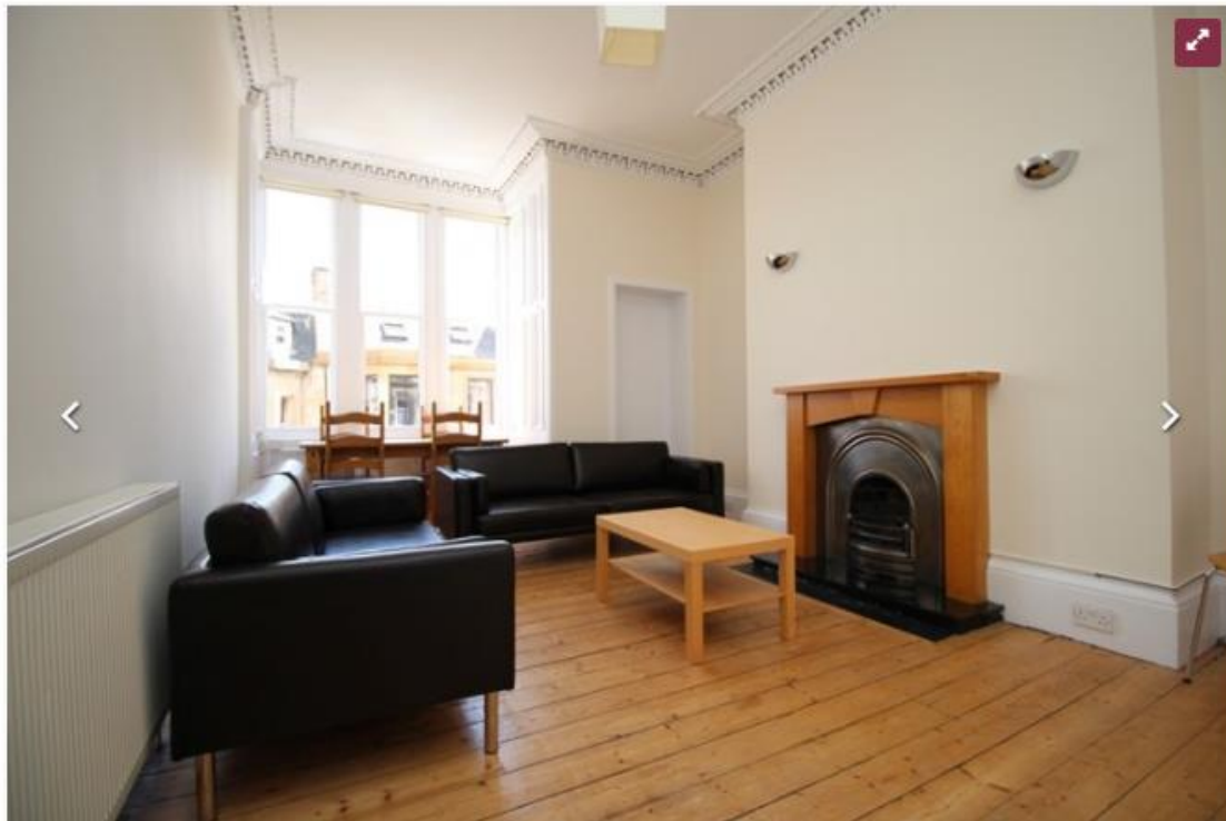
2 of 8