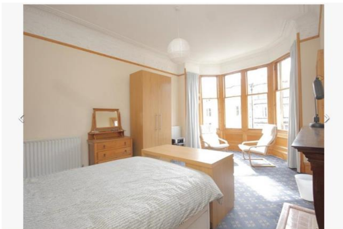
6 of 11