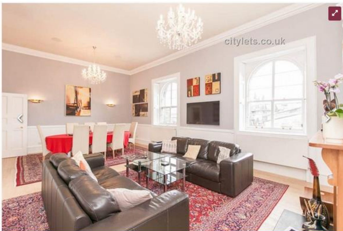
1 of 15

£2,100pcm. A rent was secured in the last quarter of 2016.