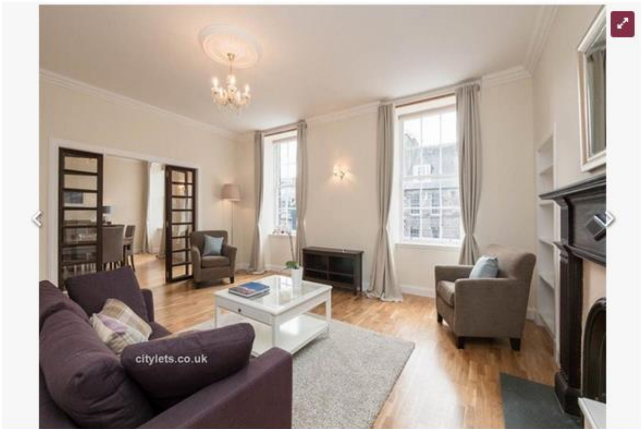
1 of 14

£1,575pcm. A rent was secured in the third quarter of 2017.