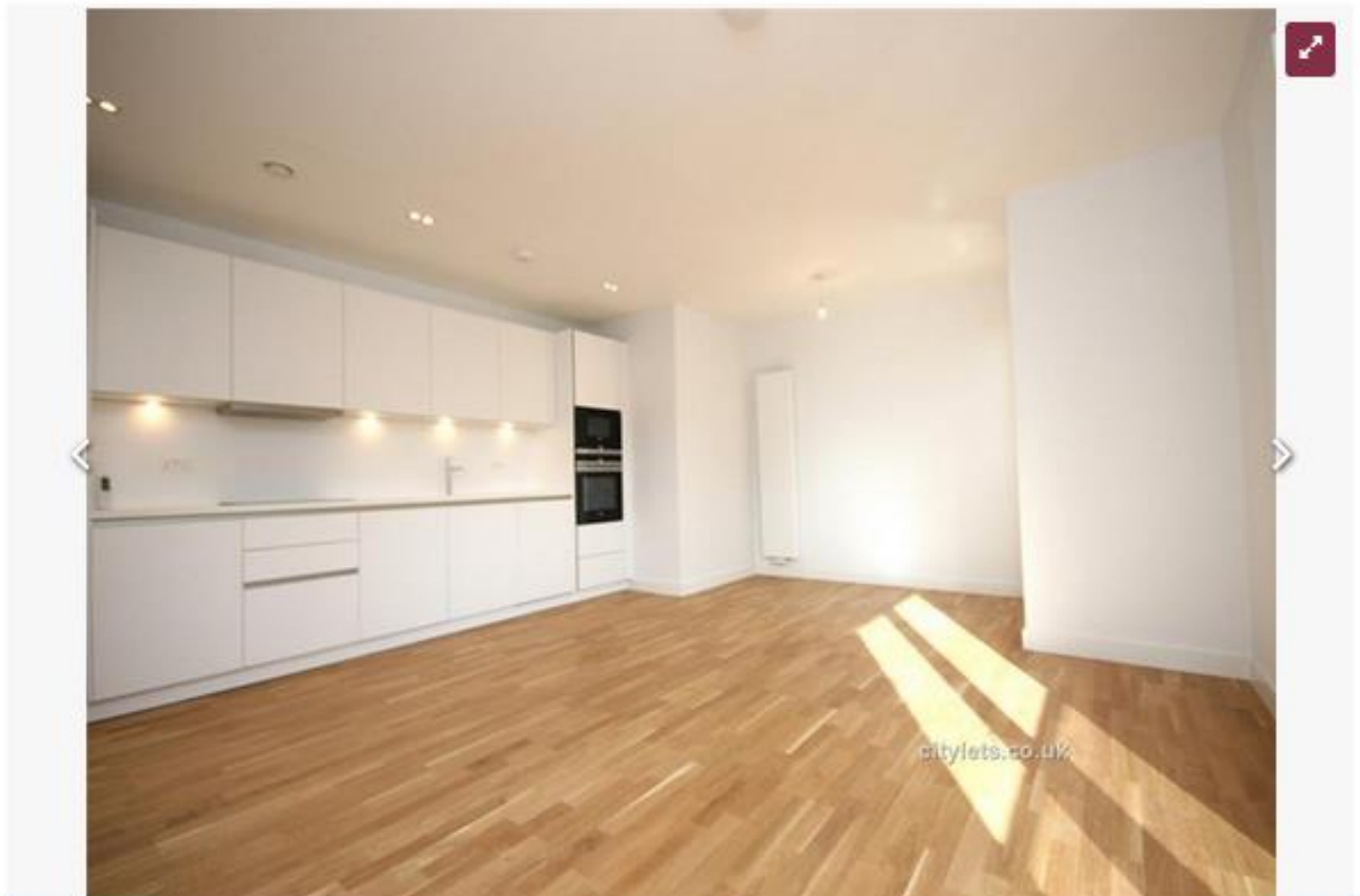
1 of 13

Property consists of living room/kitchen with all integrated and modern appliances, a spacious bedroom with ample storage integrated and a fully tiled bathroom with shower over bath. £1,000pcm. This property is currently live with Ben Property.