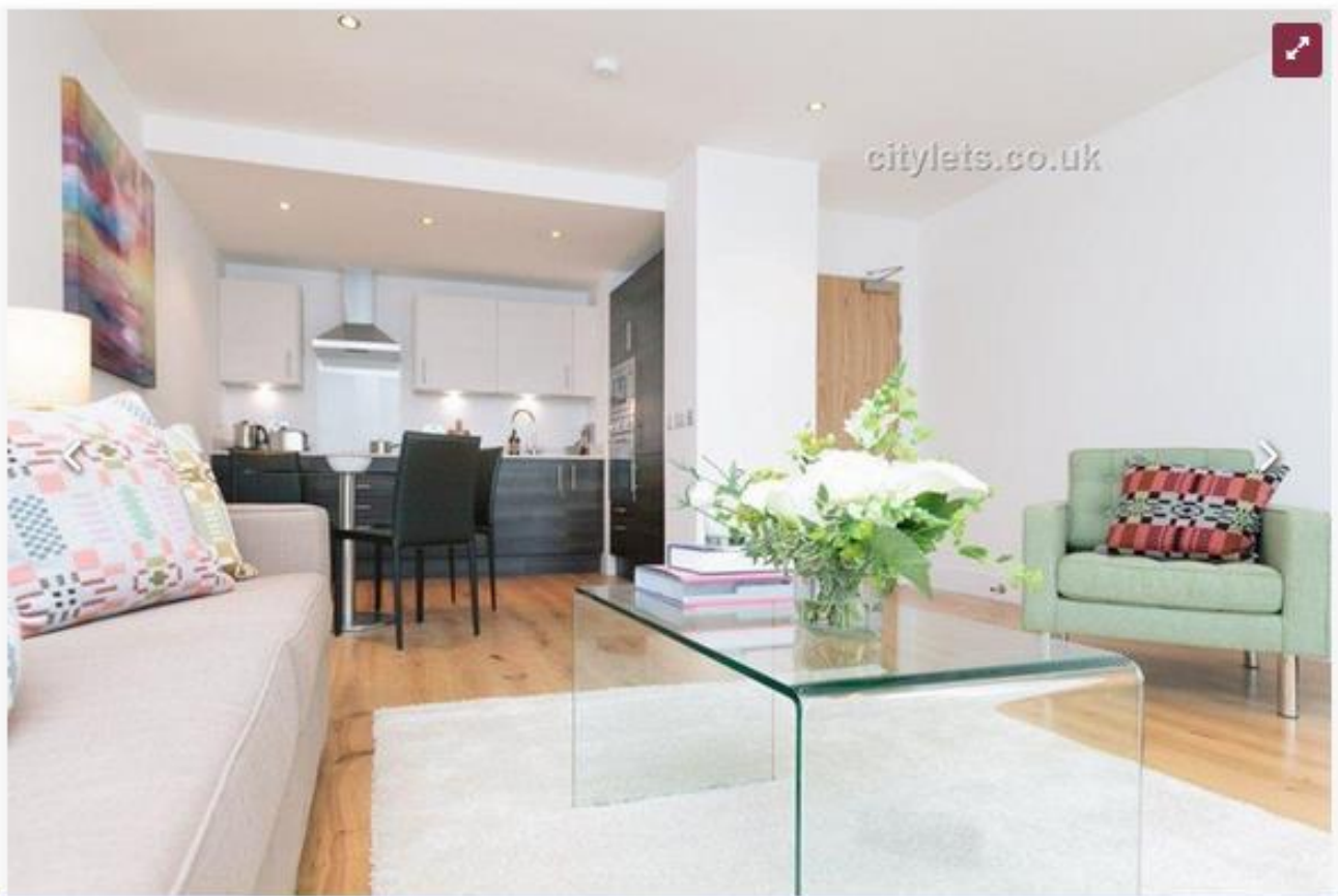
1 of 4

Property consist of double bedrooms, a stylish bathroom with shower and a large open planned, fully equipped kitchen / living room with doors leading out to the balcony. There is an en-suite shower room off the master bedroom and a large storage cupboard off the central hallway. £1,425pcm. A rent was secured in the second quarter of 2017.