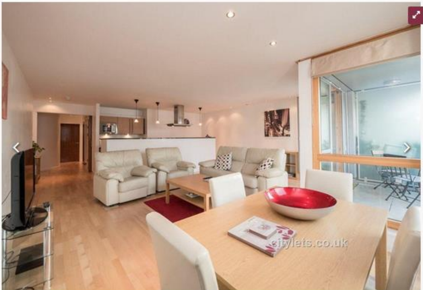
1 of 16

£1,520pcm. A rent was secured in the first quarter of 2017.