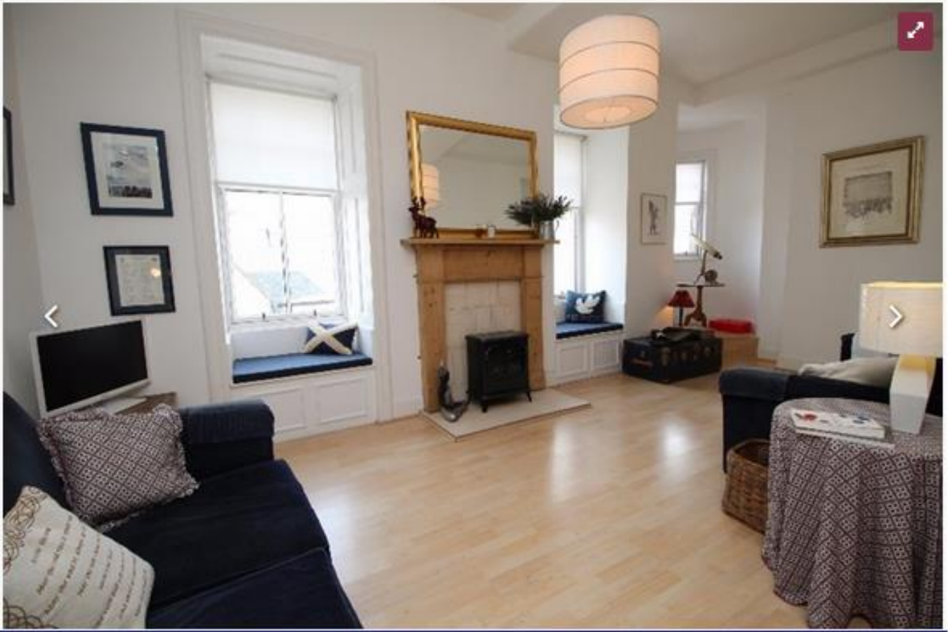
2 of 16

£1,400pcm. A rent was secured in the second quarter of 2017.