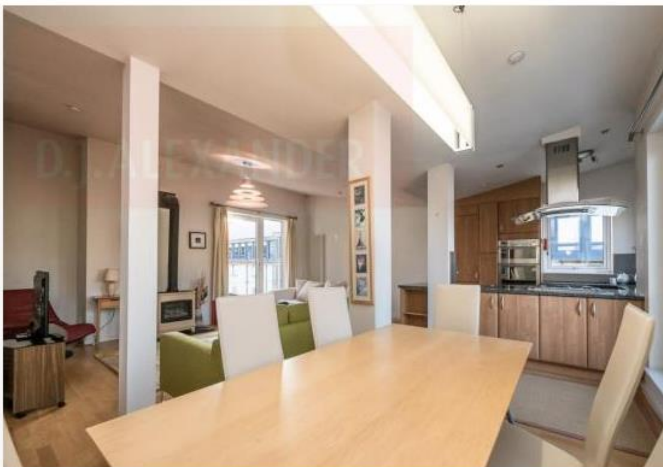
< 16 of 17 >

£1,900pcm. A rent was secured in the first quarter of 2017.