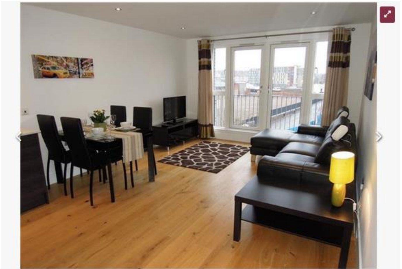
2 of 7

Property consists of open planned living area with smart, fully equipped kitchen, shower room and a double bedroom with built in wardrobes. The property is accessed via a covered terrace with an allocated private area of decking for seating outside £1,050pcm. A let was secured in the third quarter of 2107.